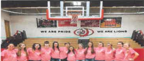
PINK OUT NIGHT

HOMECOMING February 7th VB vs Russellville 6:00pm